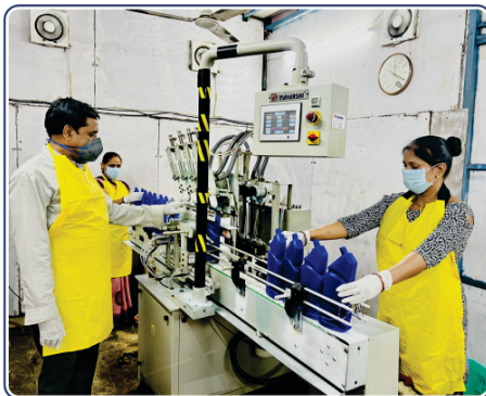
TOILET CLEANER AUTOMATIC FILLING MACHINE